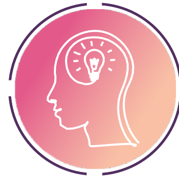
CREATIVITY & IMAGINATION