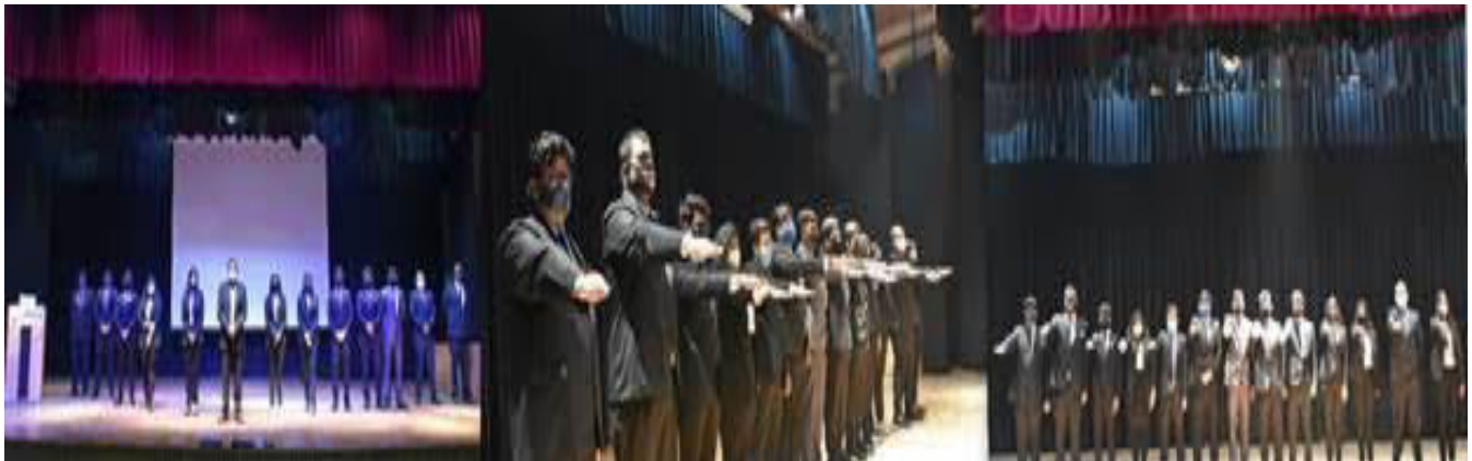
SDC – 2019-20