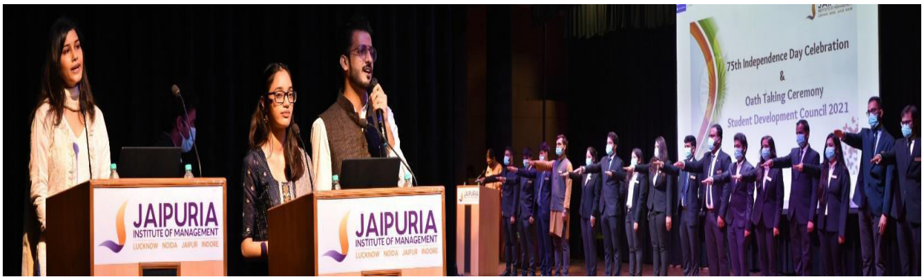
SDC – 2020-21